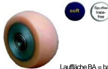
Lauffläche BA = ballig / BA = round tread