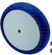
Polyurethan Räder, kugelgelagert. Polyurethan wheels, ball bearing.

verschiedene ø in natur / different ø white