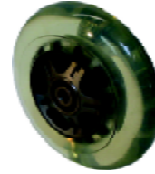
Polyurethan Skaterräder, kugelgelagert. Polyurethan skaterwheels, ball bearing.