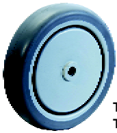
Thermoplastische Räder, kugelgelagert. Thermoplastic wheels, ball bearing.